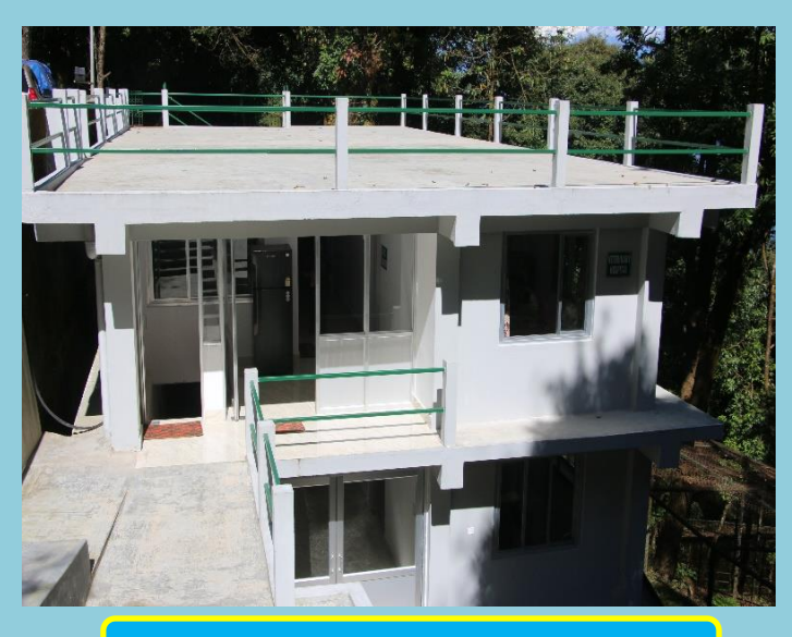
New Veterinary Hospital