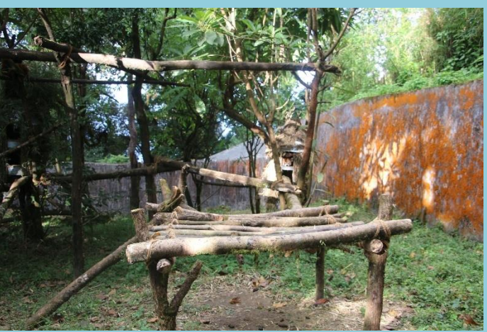
New feeding platforms in the Red Panda enlosure