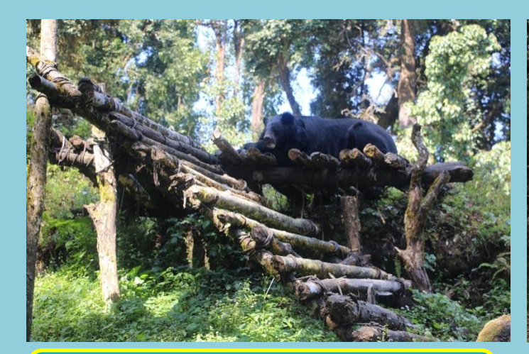
New logs and platform in the Himalayan Bear enclosure